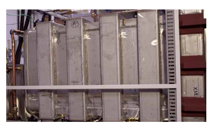
\label{eq:manufactured} \mbox{Manufactured in the UK to the highest standards}