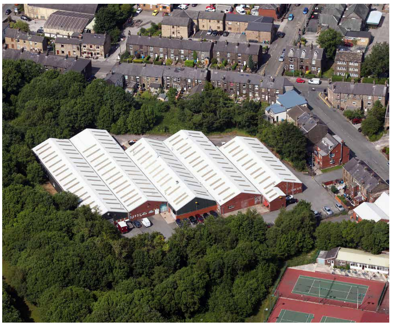
Aerial view of our manufacturing facility near Manchester